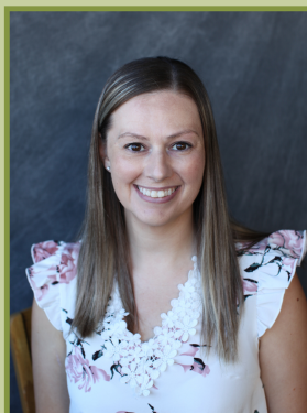
Charlene Nyberg Life Long Learning Center