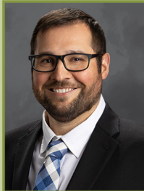
Terran Hillesland Stockman Bank