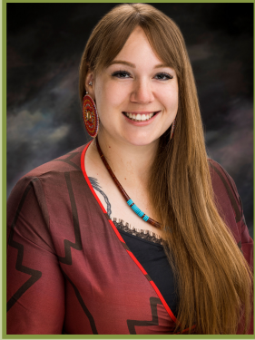
Sky McGinty All Nations Health Center