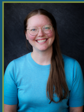
Clair Bopp Poverello Center