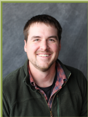
Boston Wakeham Five Valleys Land Trust